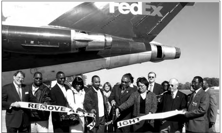
FedEx and local officials cut the ribbon on the 727 donation on October 29.

FedEx Express, a subsidiary of FedEx Corp. and the world's largest express transportation company, made a huge delivery in October to Southern University at Shreveport.