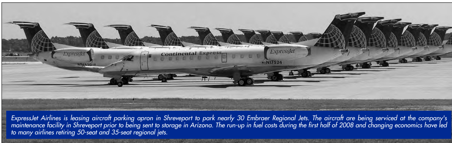
ExpressJet Airlines is leasing aircraft parking apron in Shreveport to park nearly 30 Embraer Regional Jets. The aircraft are being serviced at the company's maintenance facility in Shreveport prior to being sent to storage in Arizona. The run-up in fuel costs during the first half of 2008 and changing economics have led to many airlines retiring 50-seat and 35-seat regional jets.